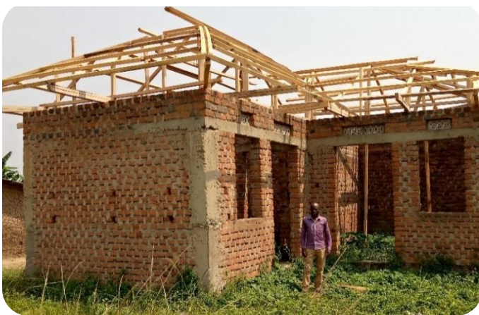
Deo's site under construction

Deo is a good role model for the youth in his village. He says, “it is in effort that we find satisfaction” .