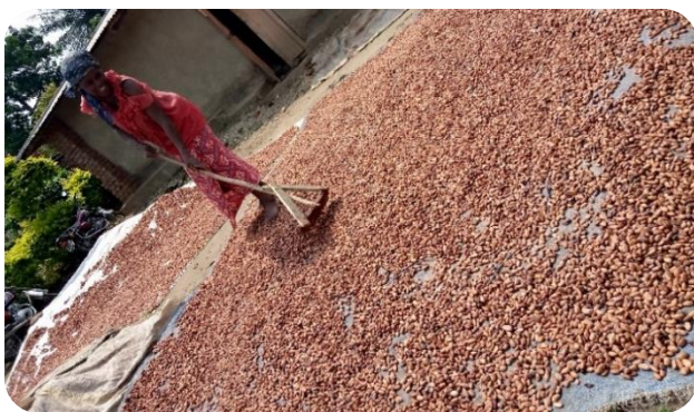
Roda drying cocoa beans on a tarpaulin

“Now they have picked up well and production is fine; cocoa is my life!” , she says.