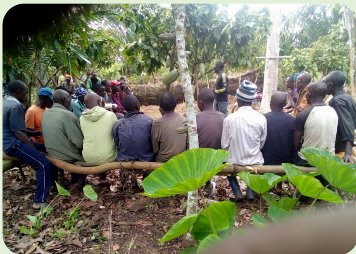
Training session at a Farmer Field School (FFS)