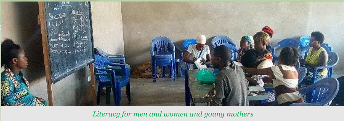
Literacy for men and women and young mothers

He intends to continue literacy classes as he needs more practice.