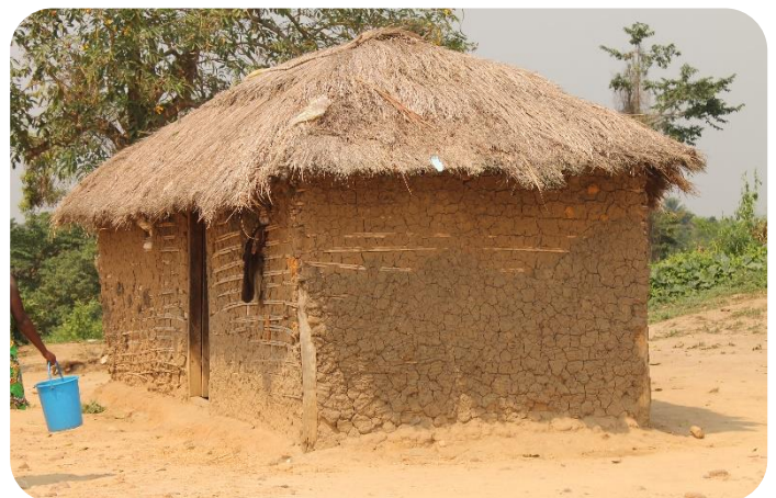
Deo's first home