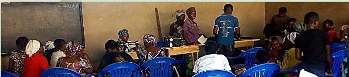
Cutting and sewing session for men and women and young mothers