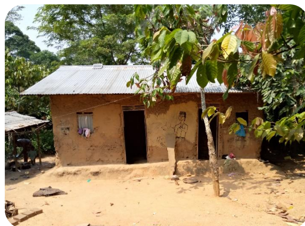
His current home