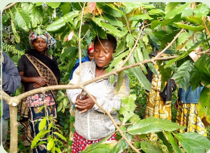
Training in pruning at a Farmer Field School