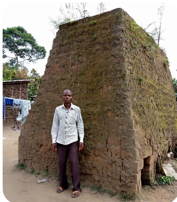
A brick kiln for construction projects